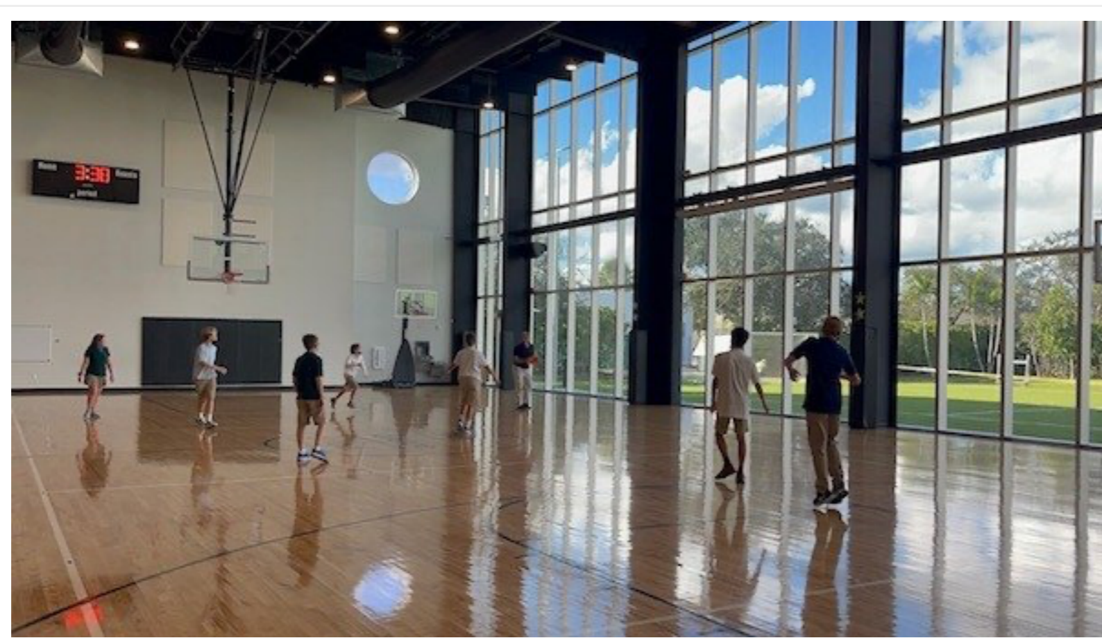
The Greene School Gymnasium